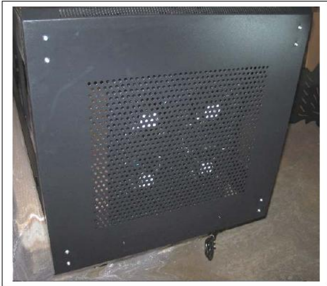
Image showing the installed 4-Way 'Fan Tray' positioned correctly on inner surface of Cabinet roof.

When operational the 'Fan Tray' will extract warm air from the Cabinet and 'exhaust' it through the perforated roof to help reduce heat build up and extend component life of installed Active products such as Switches.